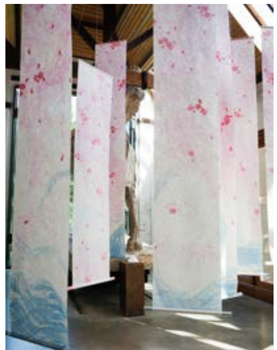
Image: Hiroko Imada, Installation image of Sakura saku , 2024.

Discover the enduring influence of the historical Japanese woodblock printing process and experience a captivating new site-specific installation at Watts Gallery by Tokyo-born contemporary artist, Hiroko Imada. Imada’s work, titled Sakura saku ('Cherry blossoms are blooming'), celebrates the natural themes in the 19th-century prints in Edo Pop: Japanese Prints 1825 - 1895 .